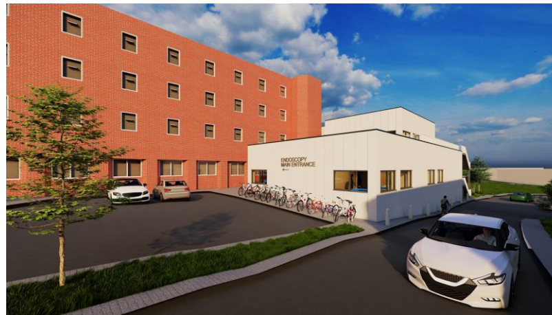
New Endoscopy Unit