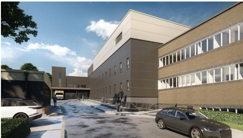
Acute Medical Unit